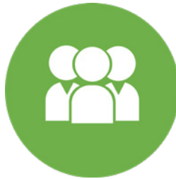
146 Team Members Powering Program