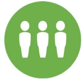
1500+ KIPPsters Served by Program