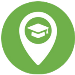
21 School Sites Operating Program