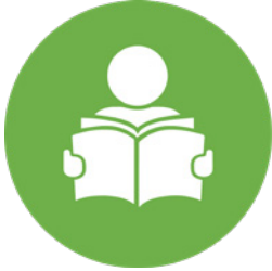
Academic & Literacy Support