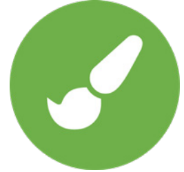
Various Enrichment Activities