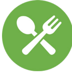
Healthy Supper & Snacks Daily