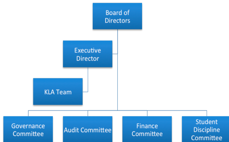
Figure 8: The Charter School Standing Board Committees

The KIPP LA Schools Board may also use, from time to time, ad hoc committees as well as task forces to help with specific issues or projects including special events, real estate/facilities, etc.